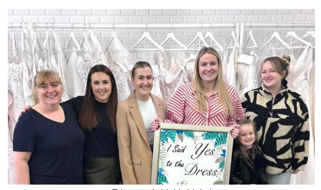
Etiquette bridal bridal shop