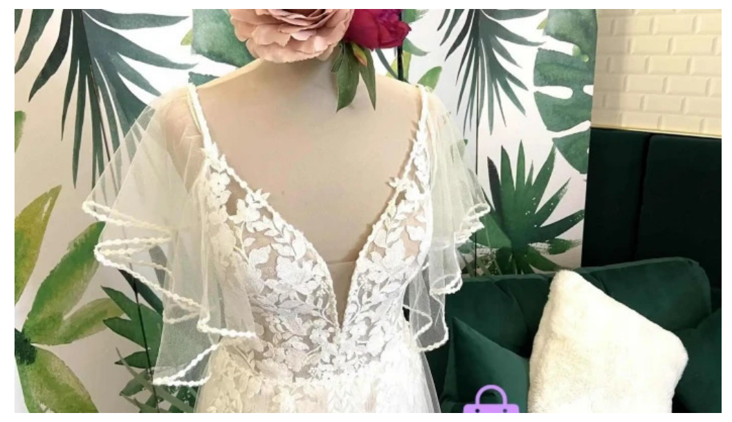
Etiquette bridal wedding dress