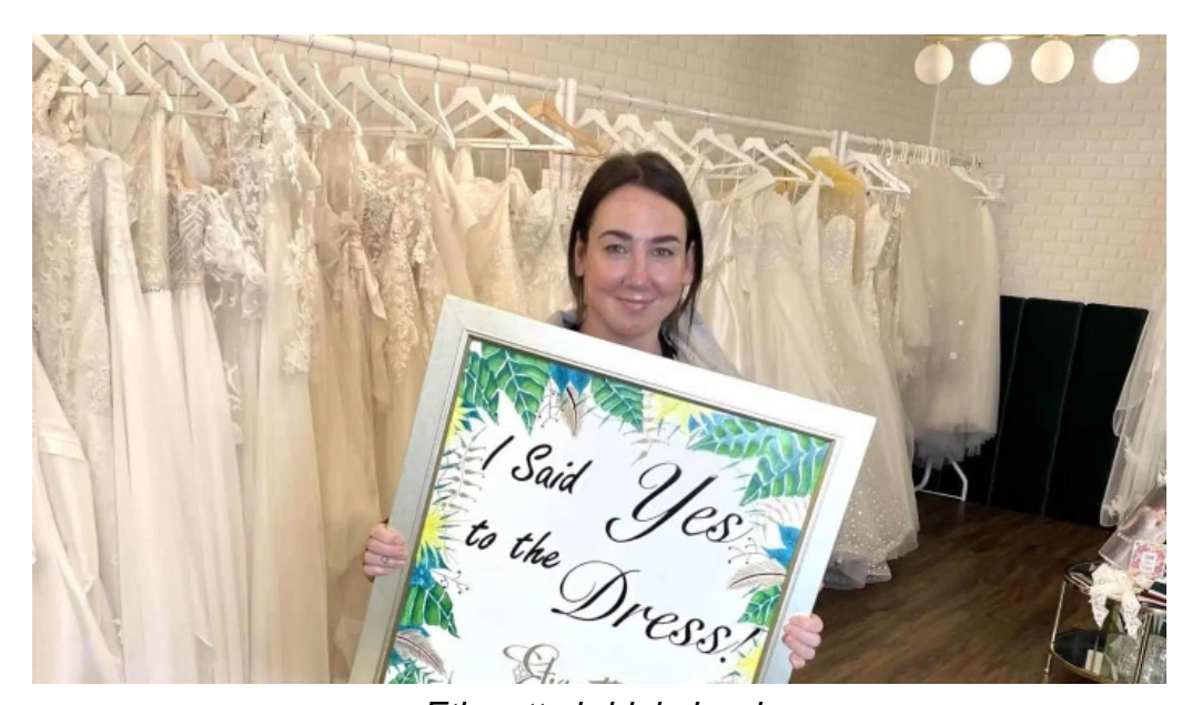
Etiquette bridal aberdeen