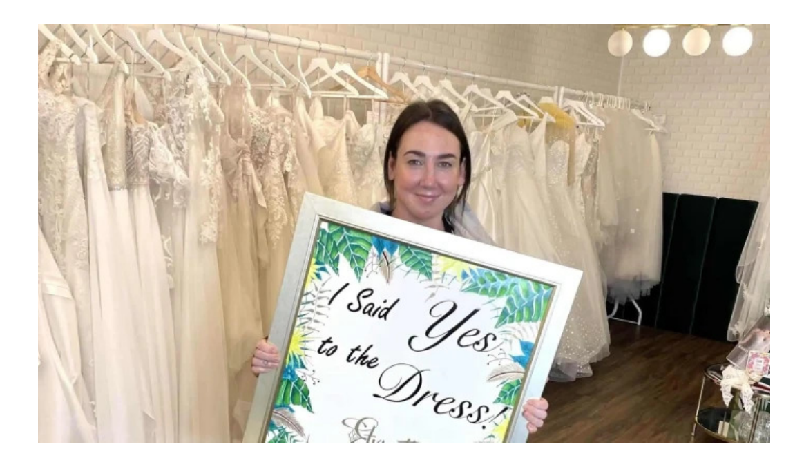
Bridal Shop In Aberdeen