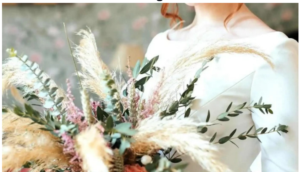
Etiquette bridal wedding