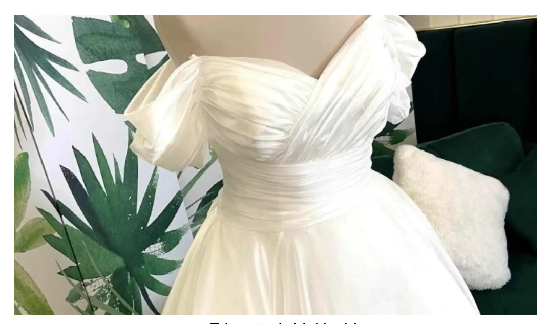
Etiquette bridal inside