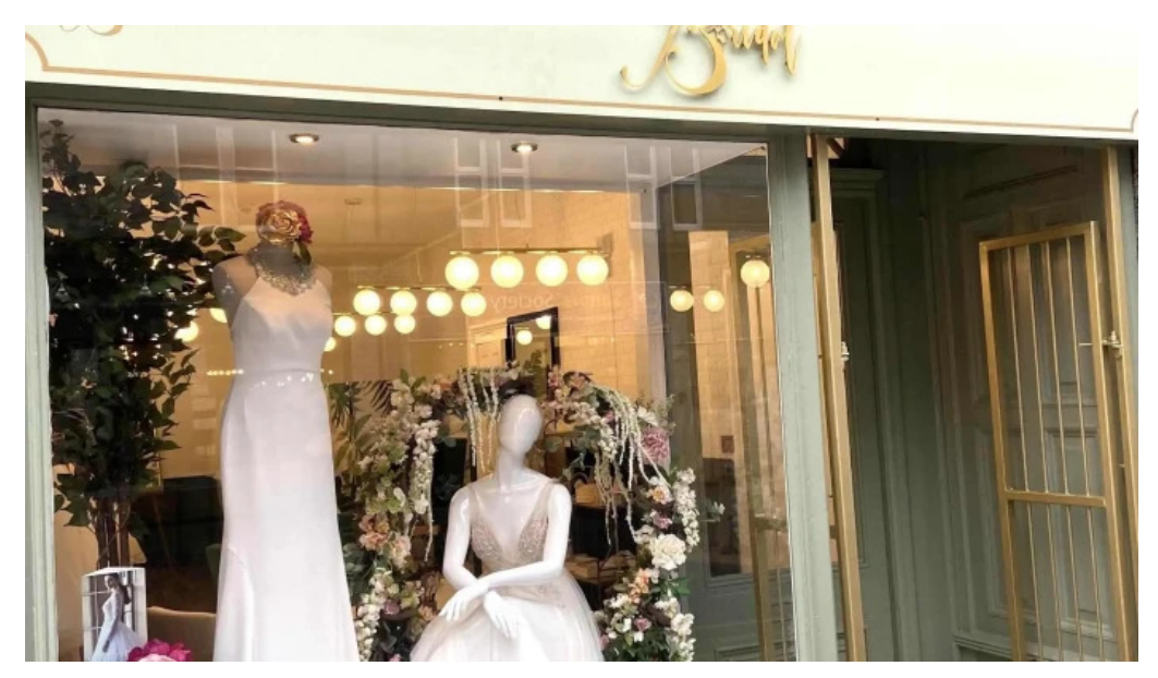
Etiquette bridal all