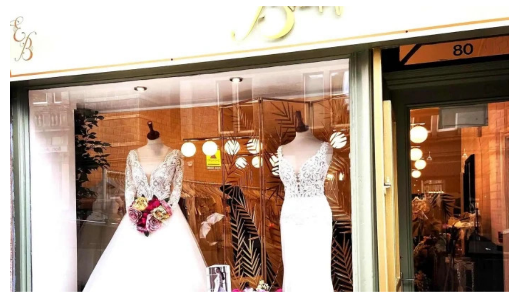
Etiquette bridal by owner