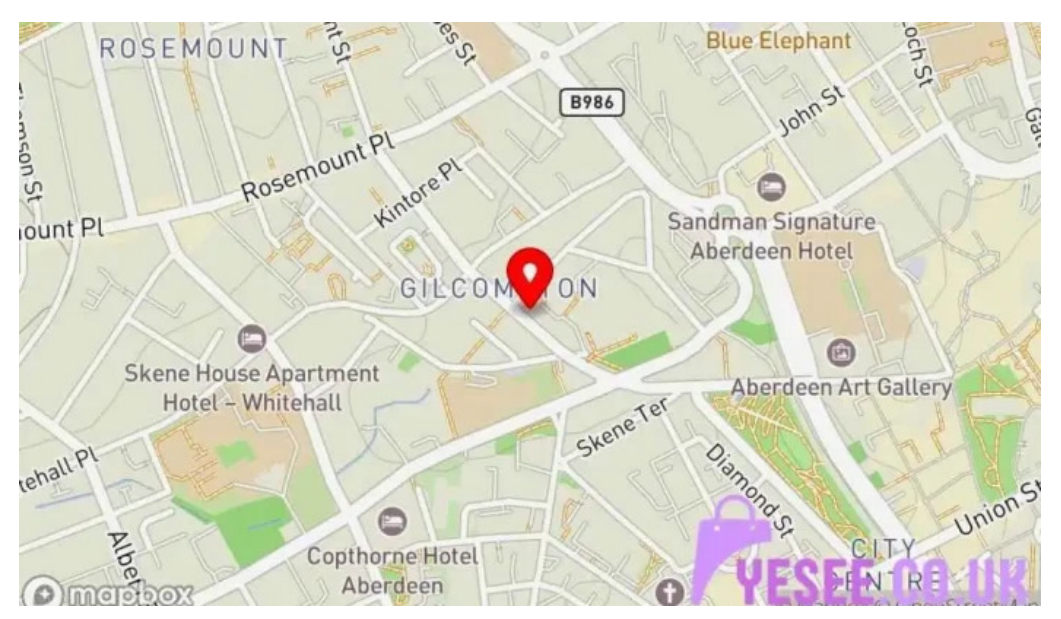
Etiquette bridal map