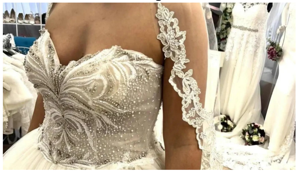
Heritage bridal wedding dress