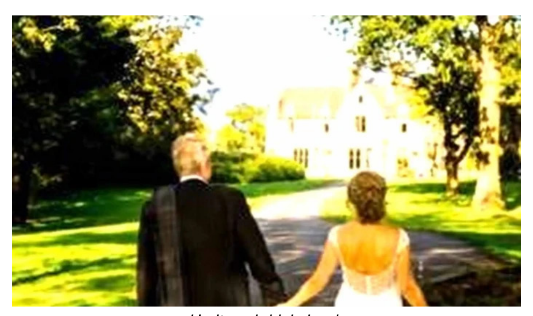
Heritage bridal aberdeen