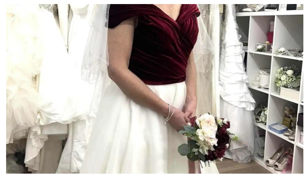
Heritage bridal photograph