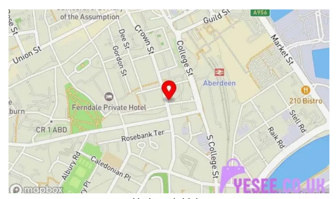
Heritage bridal map