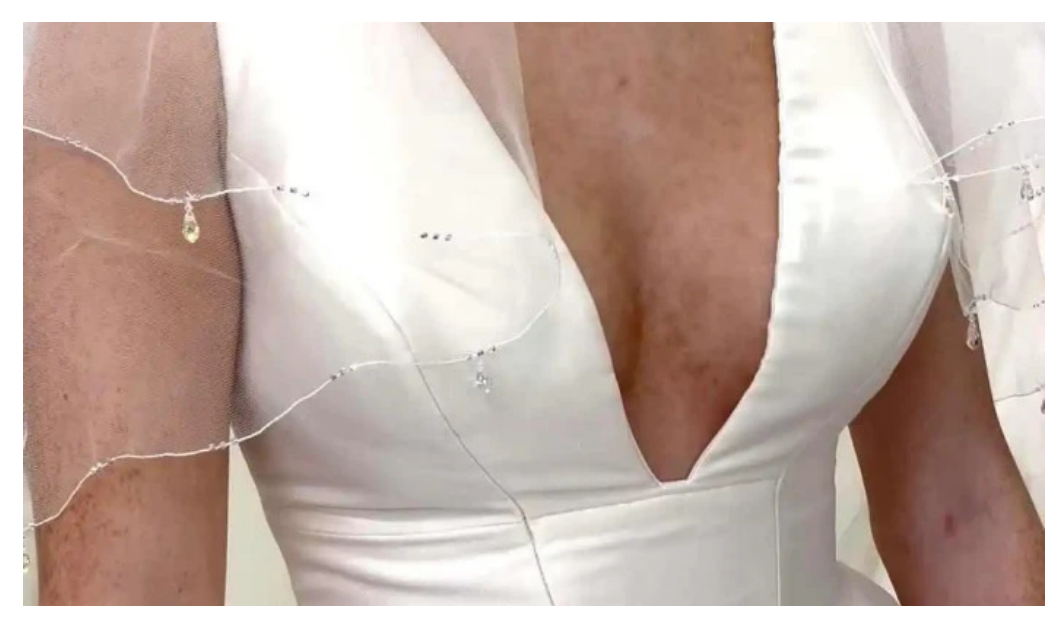
Heritage bridal videos