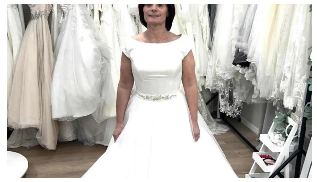
Heritage bridal latest