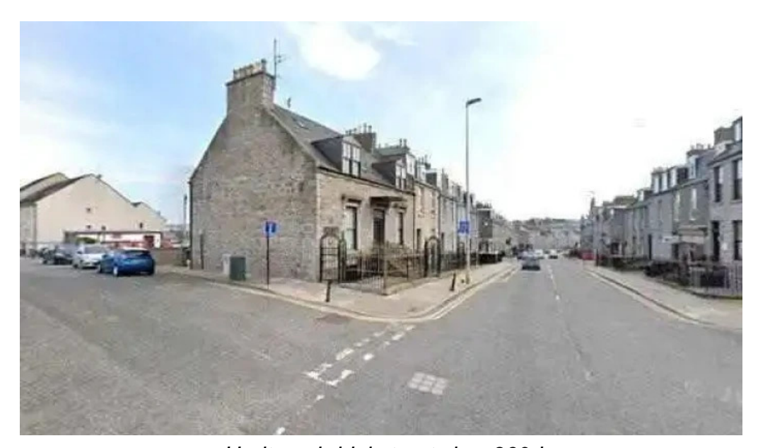
Heritage bridal street view 360deg