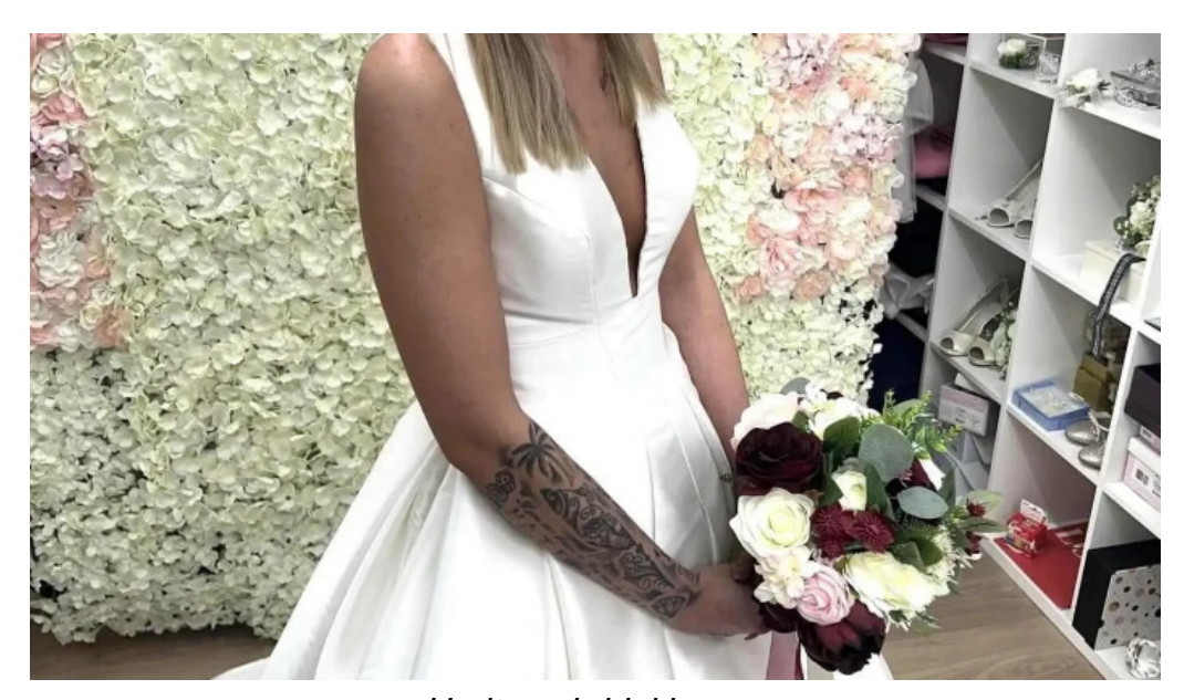
Heritage bridal by owner