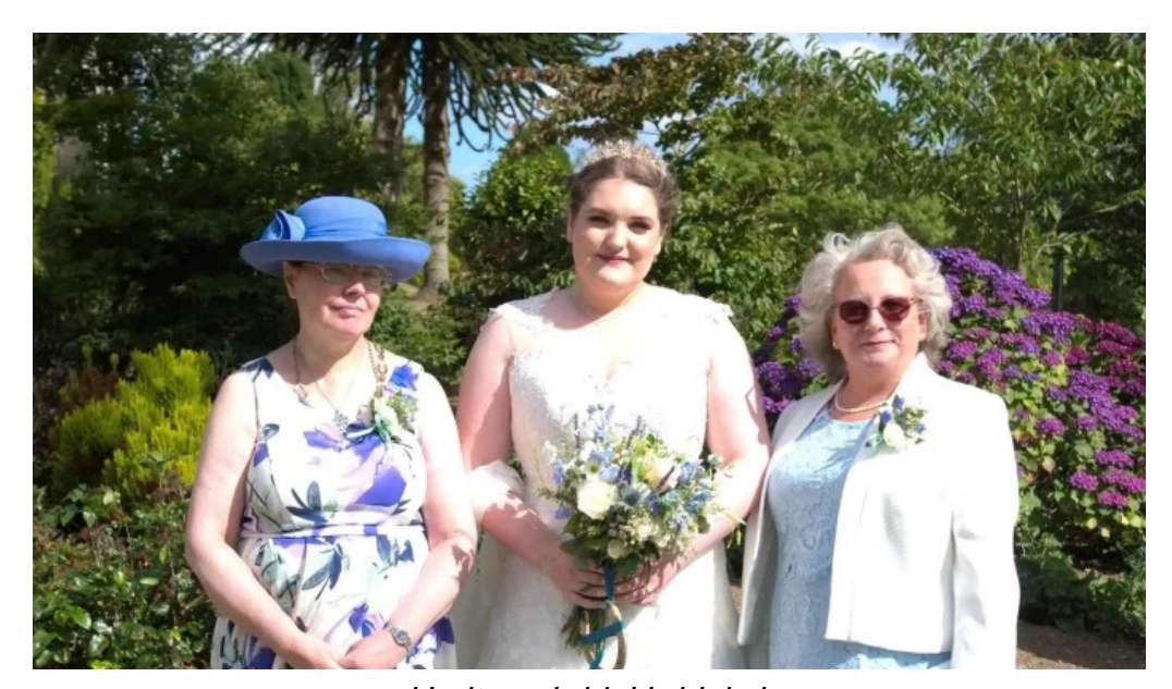
Heritage bridal bridal shop