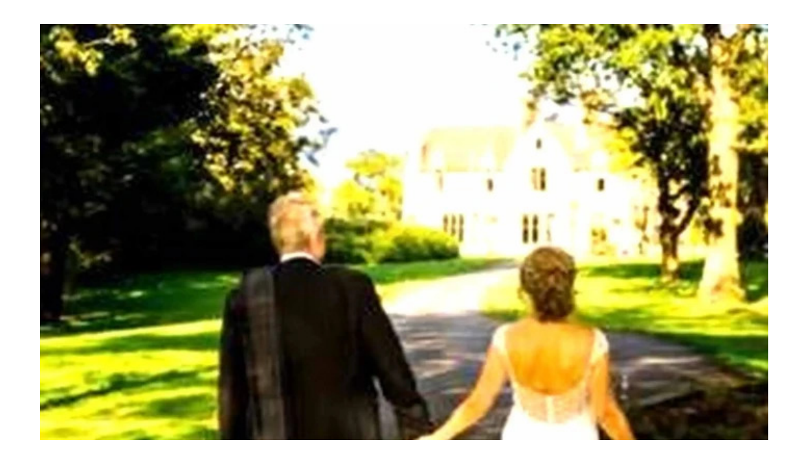
Bridal Shop In Aberdeen