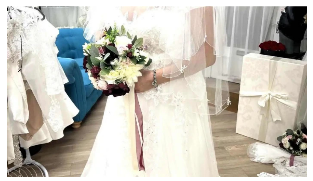
Heritage bridal bride