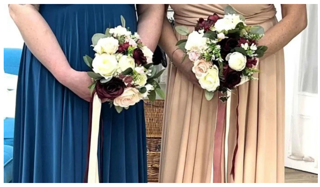
Heritage bridal all