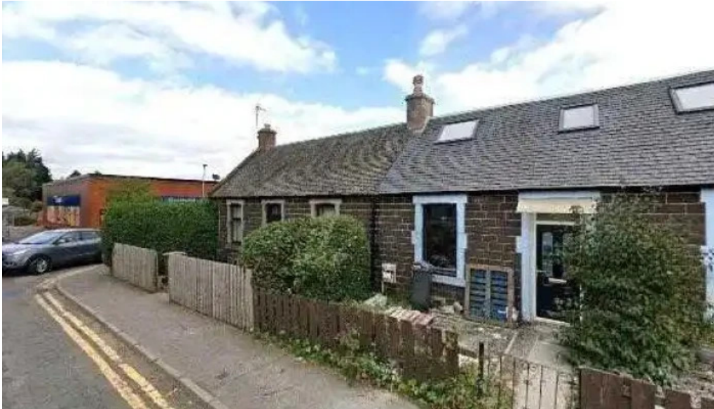
Scottish designer knitwear joyce forsyth street view 360deg