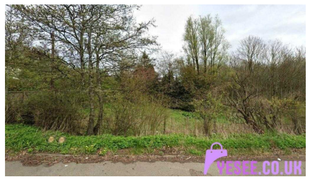
Sew sew airdrie