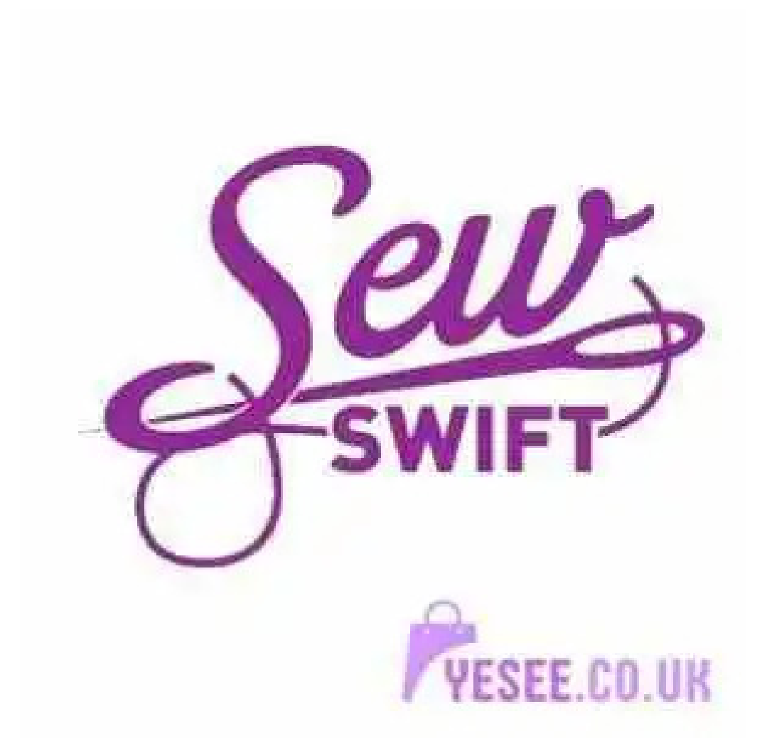
Sewswift by owner