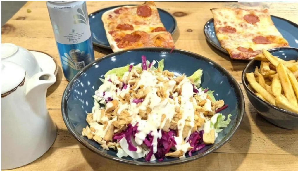
Nutmeg at morrisons clothing store