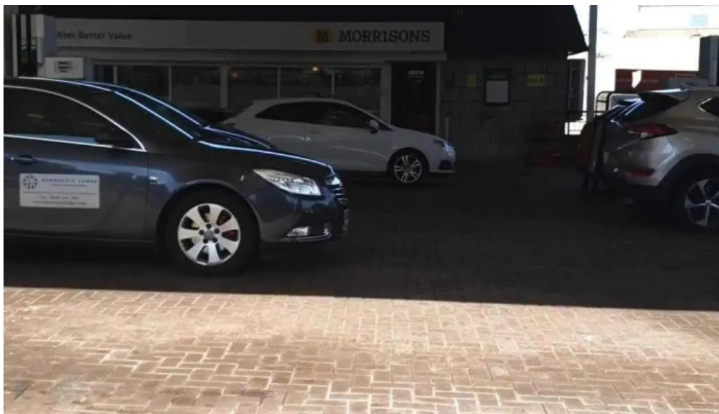
Nutmeg at morrisons inside