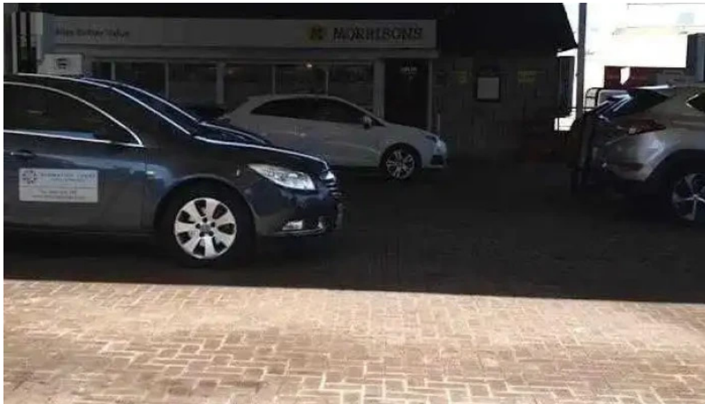
Nutmeg at morrisons aberdeen