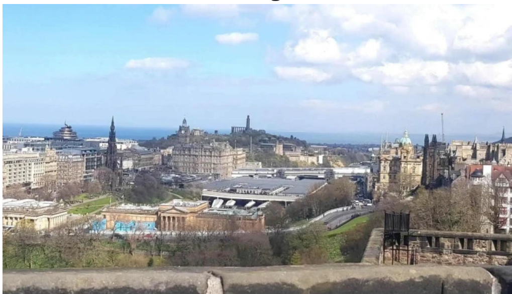
The edinburgh woollen mill where