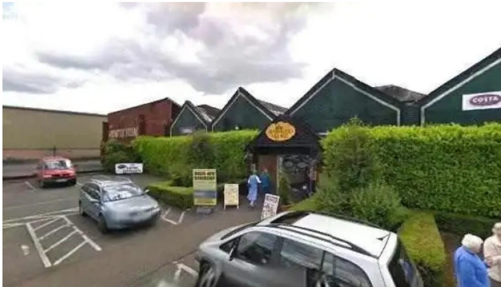
The edinburgh woollen mill street view 360deg