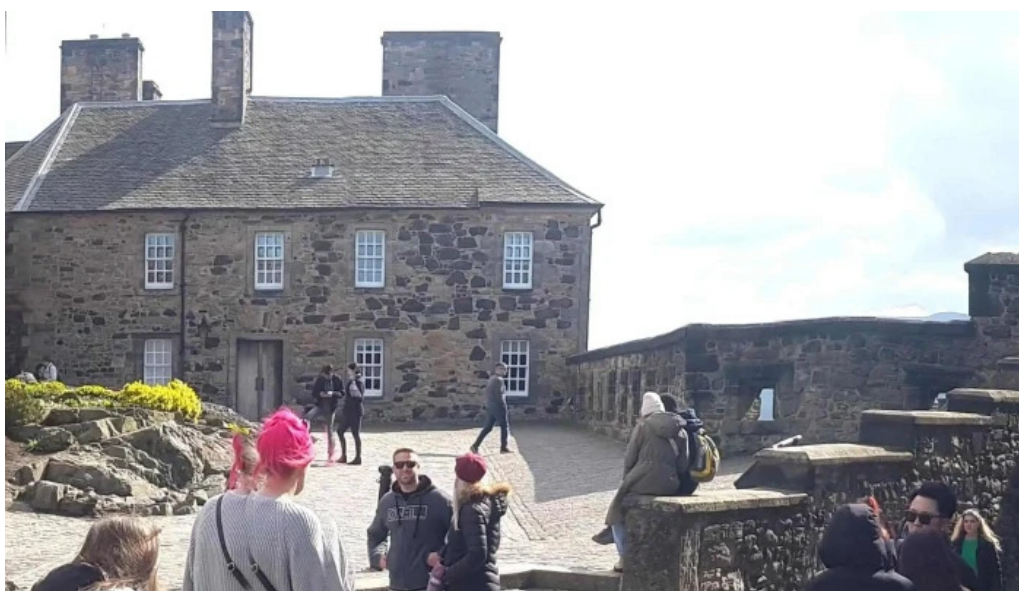
The edinburgh woollen mill alexandria