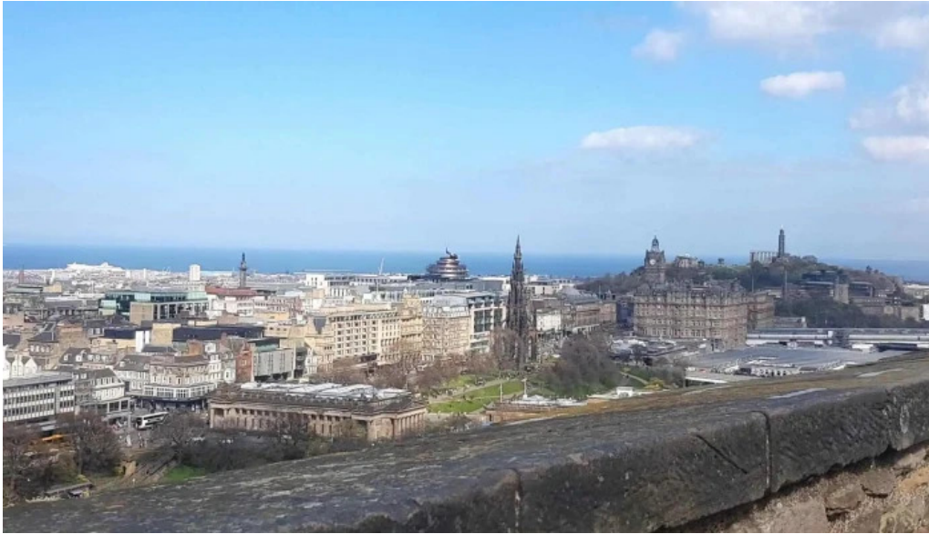
The edinburgh woollen mill location