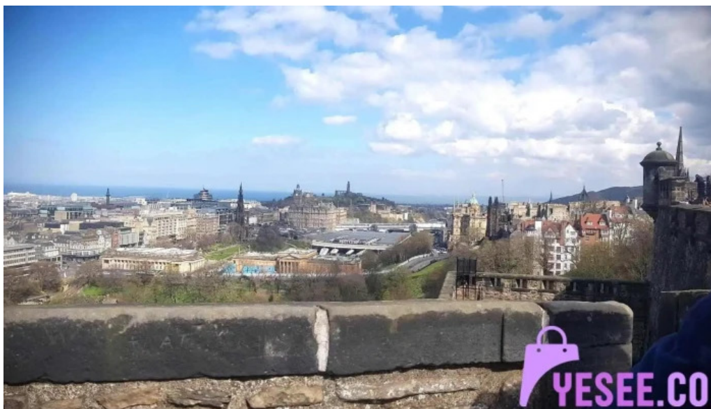
The edinburgh woollen mill all