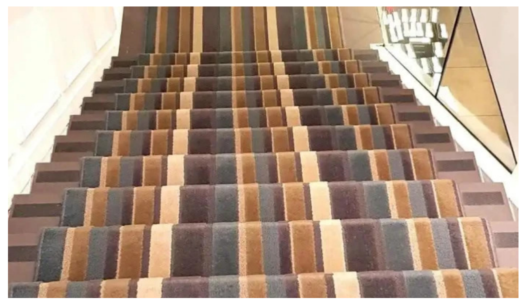
Cruise fashion Itd inside