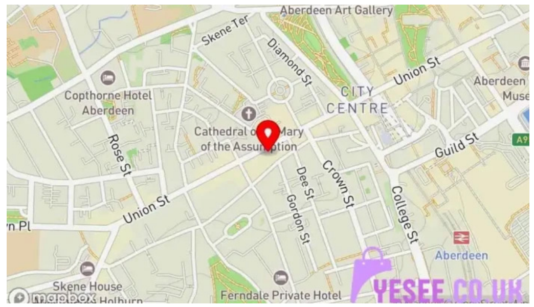
Cruise fashion Itd map