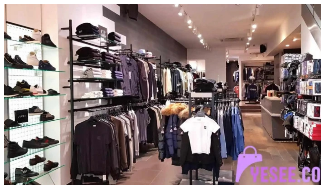
Cruise fashion Itd aberdeen