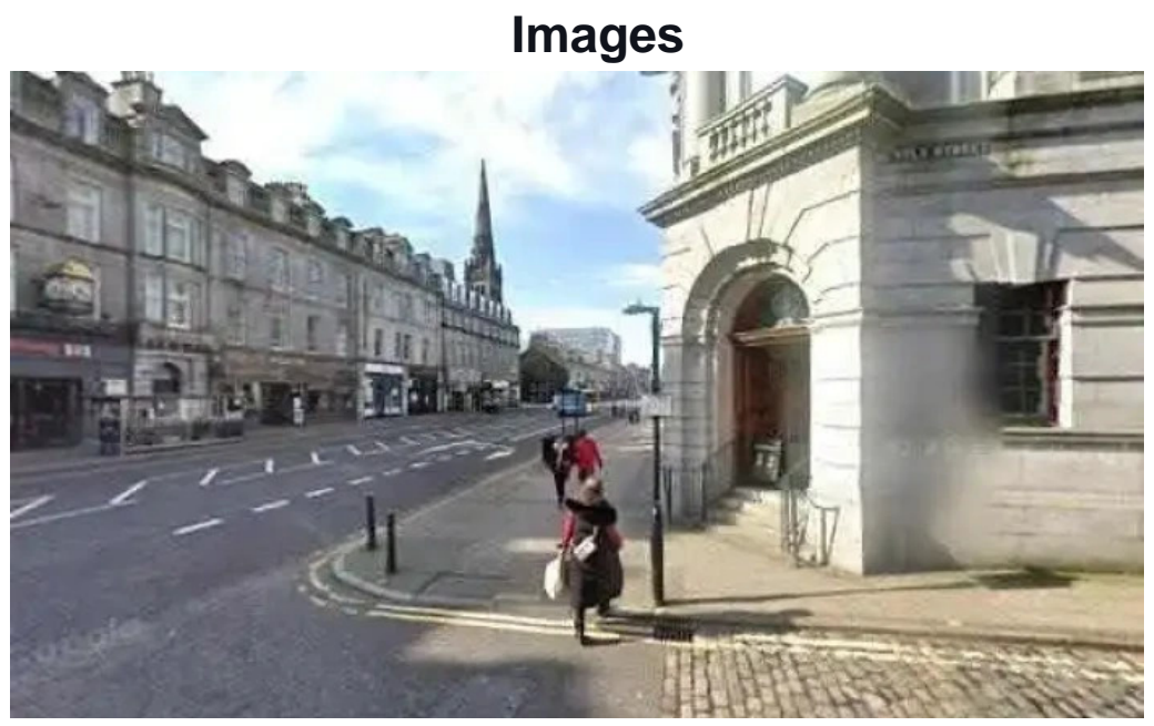
Cruise fashion Itd street view 360deg

If you require to alter any data that you feel is incorrect regarding this web, we urge you to forward a message and we will adjust it as soon as possible. With anticipation thank you very much.