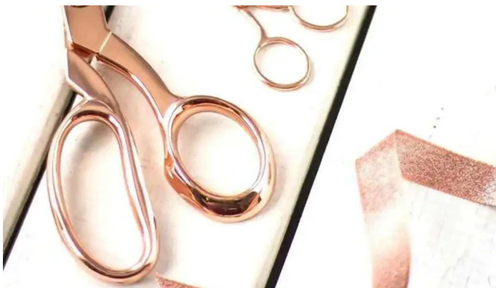
Gloria valentine all