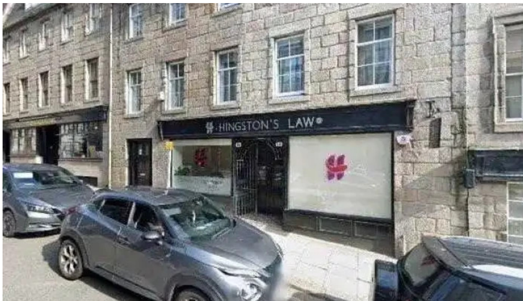
Gloria valentine street view 360deg