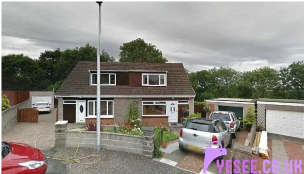
Prestige sewing dressmaker bridal wear specialist alloa