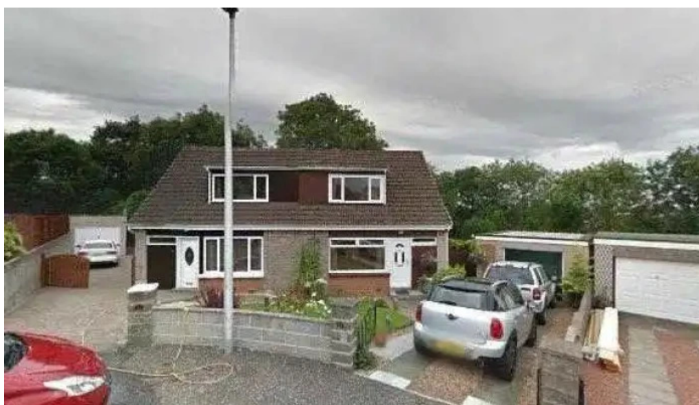
Prestige sewing dressmaker bridal wear specialist all