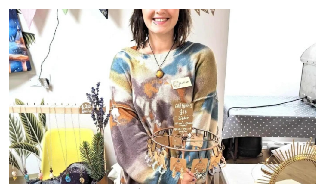
The foggie neuk catalog