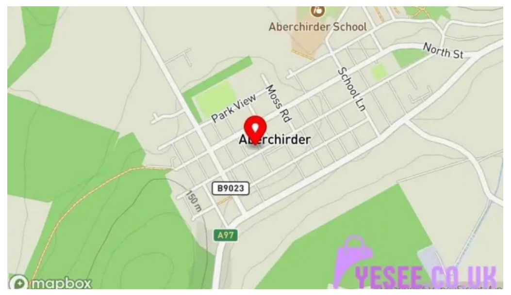
The foggie neuk map