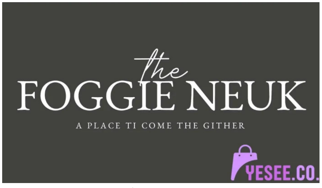
The foggie neuk by owner