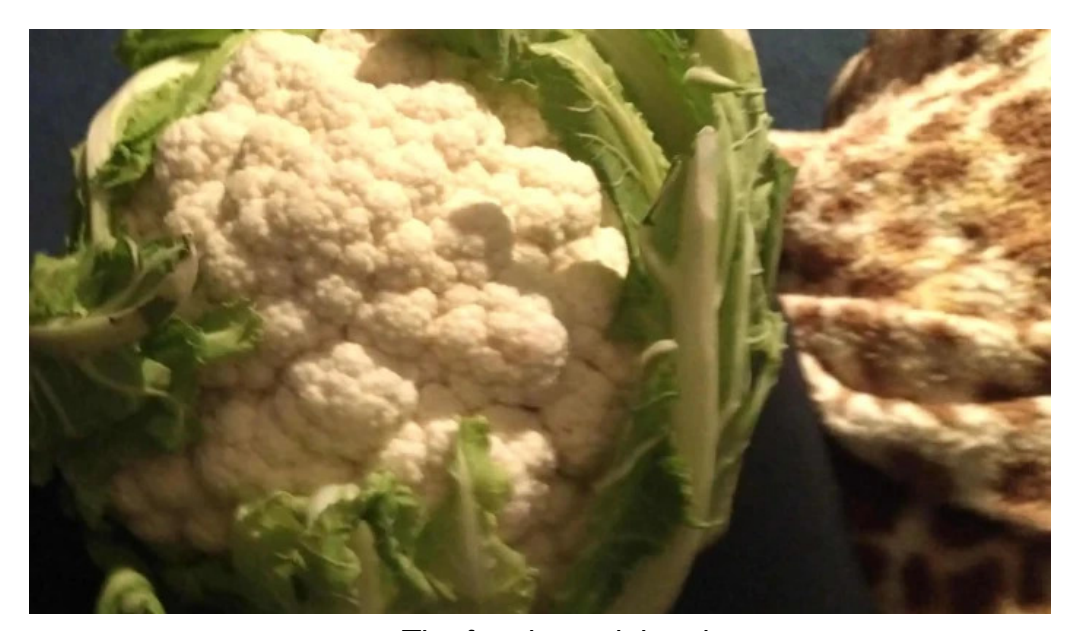
The foggie neuk huntly