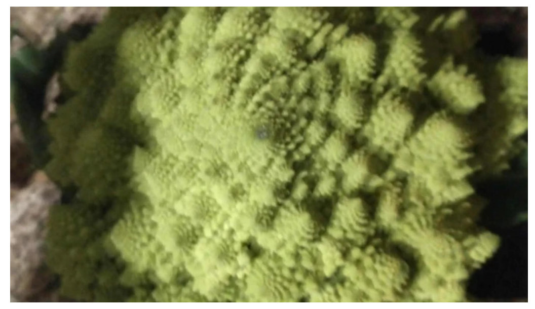
The foggie neuk event venue