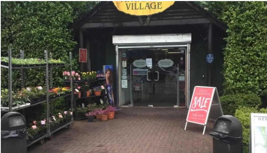
Antartex village parking