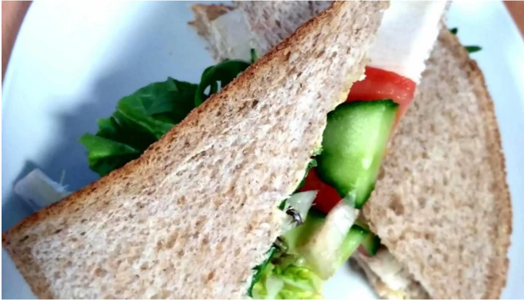
Antartex village phone