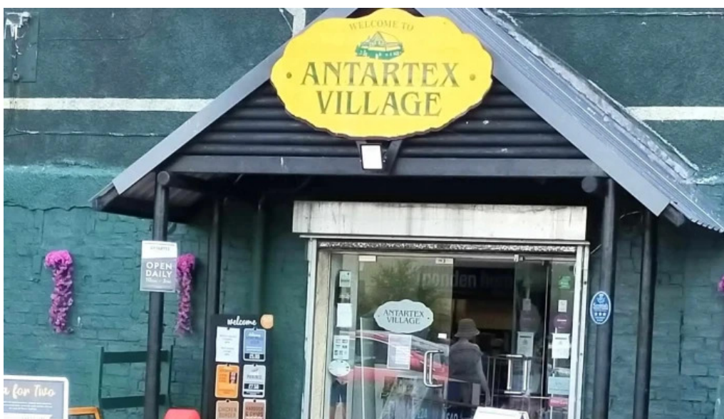
Antartex village address