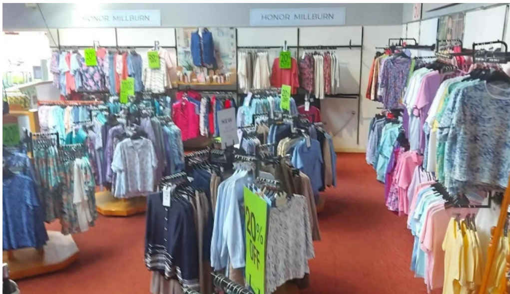
Antartex village instagram