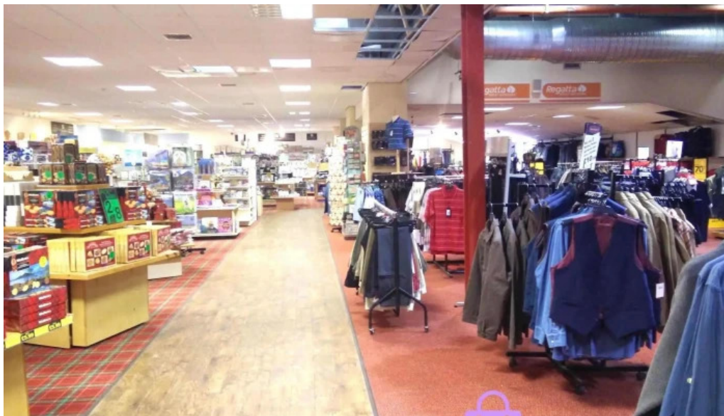
Antartex village all