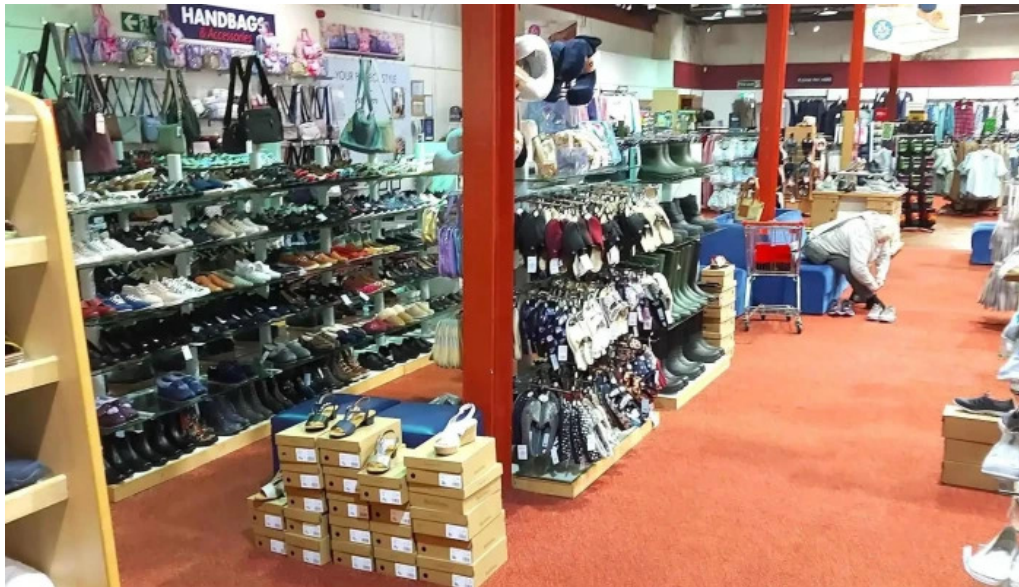
Antartex village area