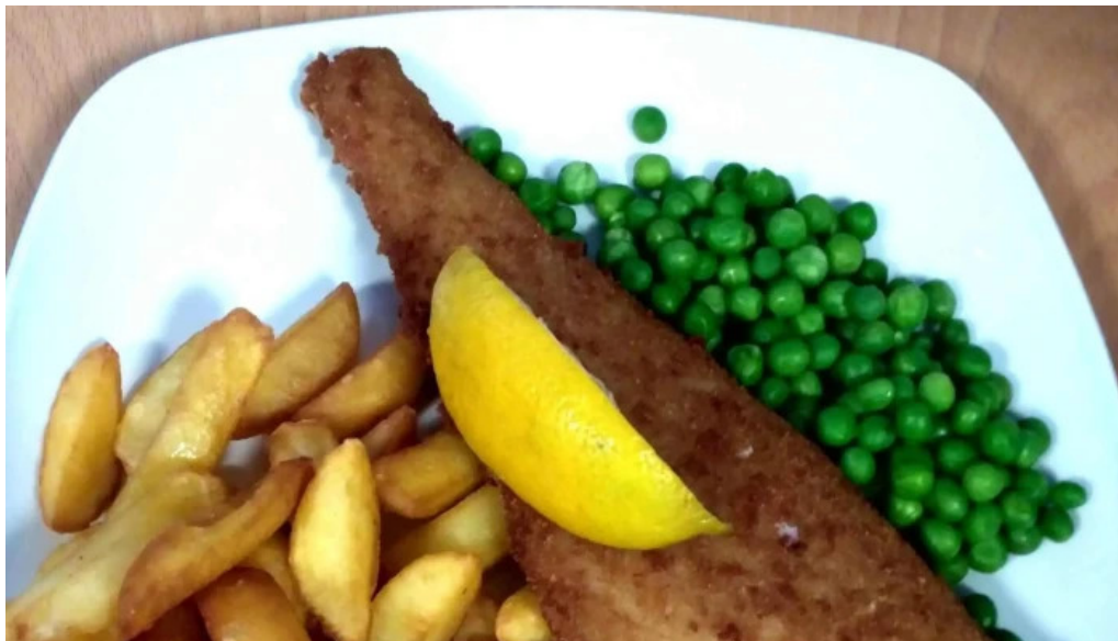
Antartex village website