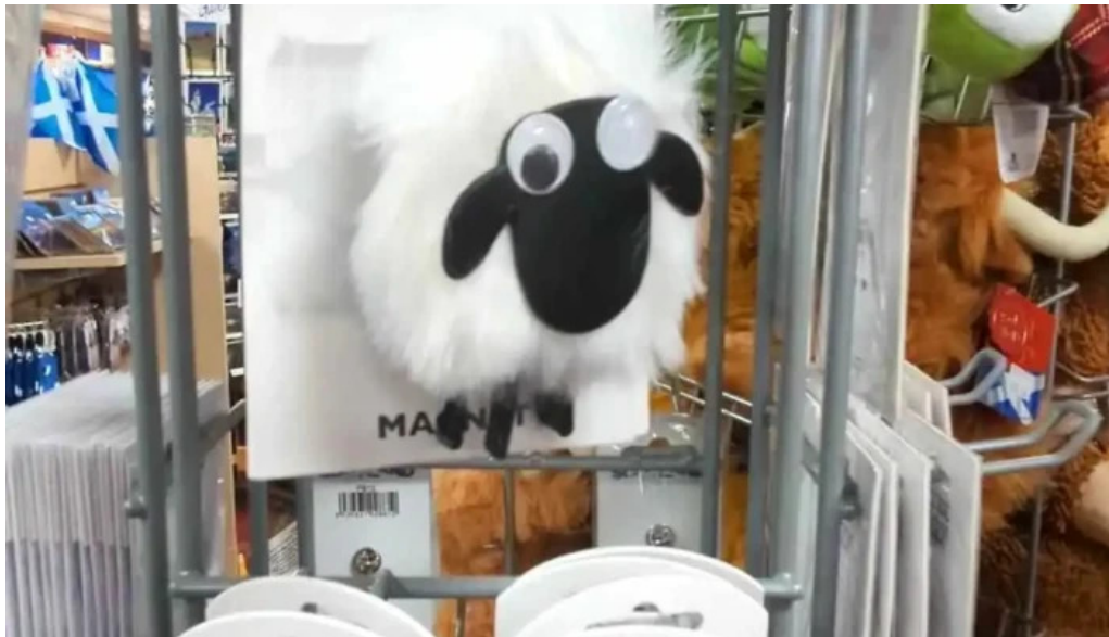
Antartex village inside