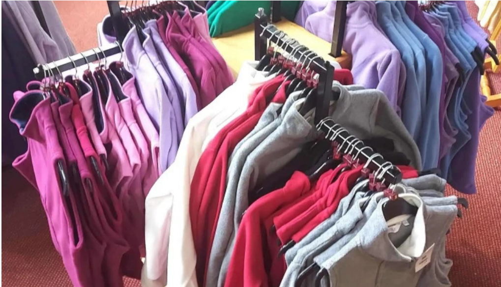
Antartex village outlet mall