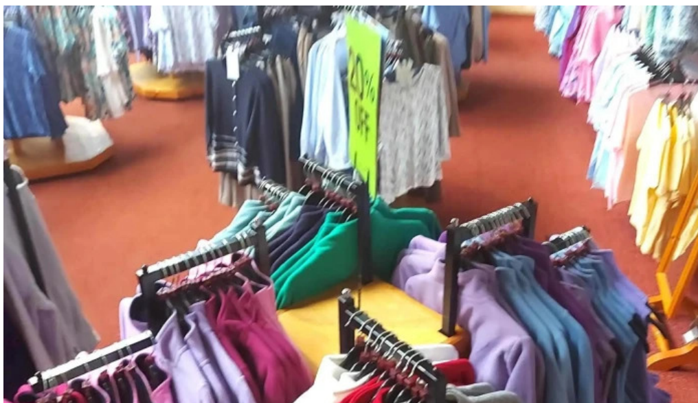
Antartex village alexandria