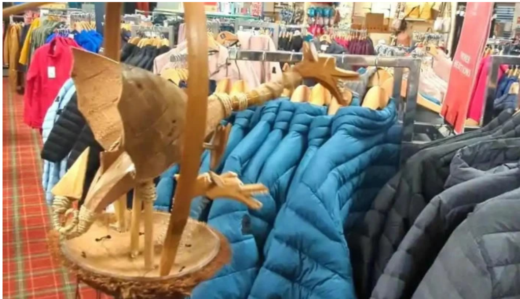
Antartex village videos