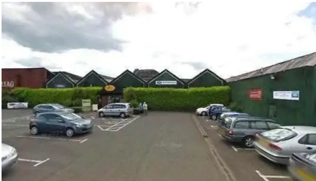
Antartex village street view 360deg