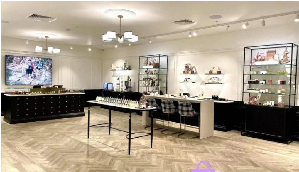
Jo malone london inside