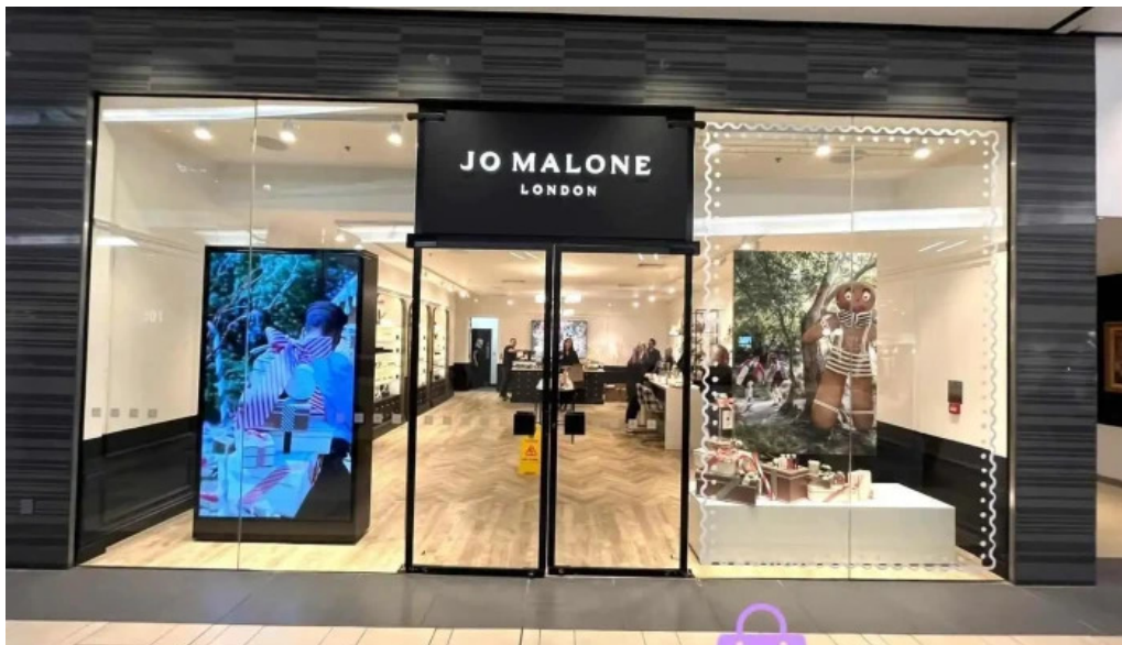
Jo malone london all