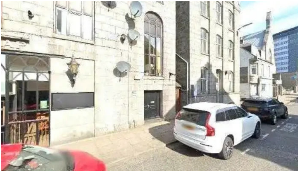
Golden stitches street view 360deg