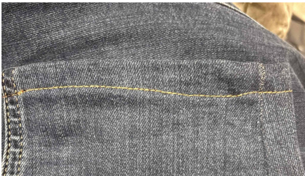
Golden stitches aberdeen