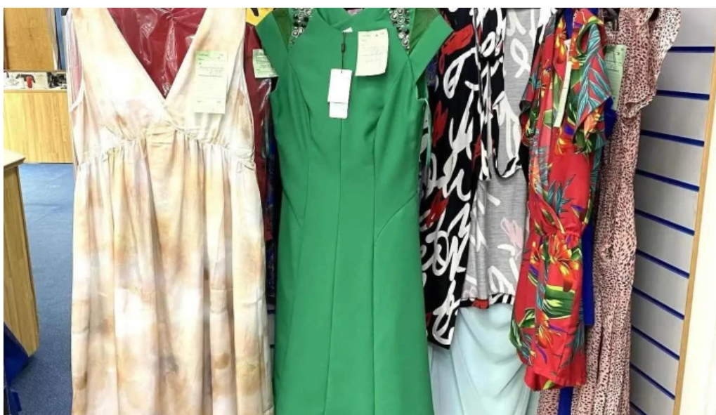
Golden stitches all