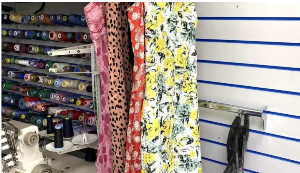
Golden stitches by owner