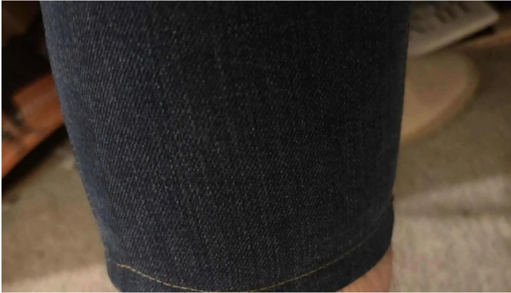
Golden stitches tailor