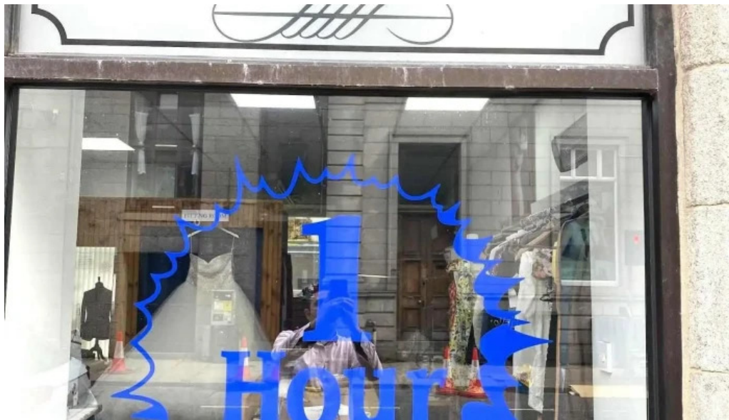
Golden stitches exterior