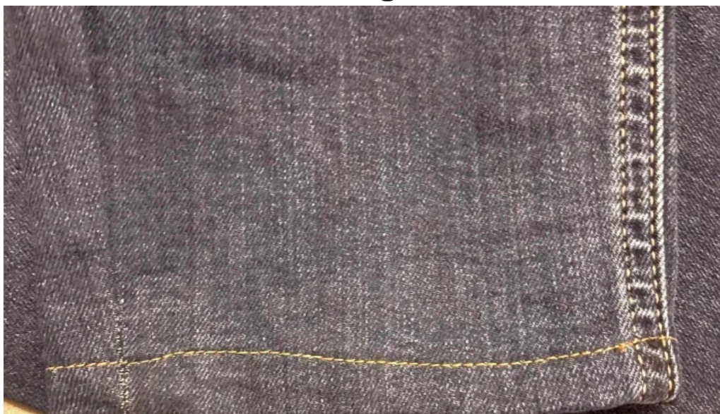
Golden stitches where