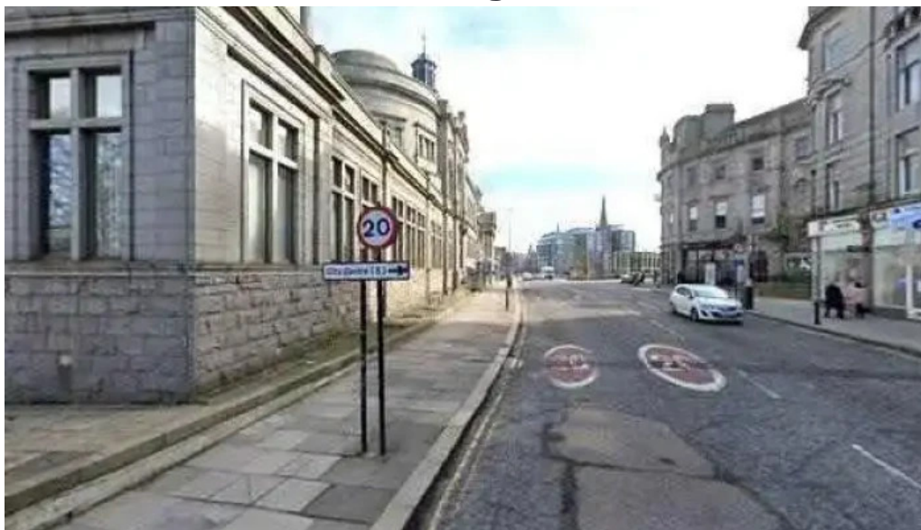
Oxfam street view 360deg